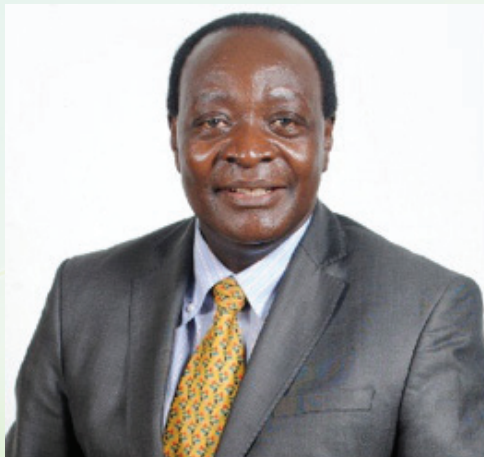
Hon. (Dr) Wilbur Ottichilo, CBS, MP

The Kenya Climate Change Act 2016 has immense potential of empowering the government and people of Kenya to tackle the effects of climate change as well as leverage on its potentials. The Act will protect Kenyans from the ravages of climate change and ensure low carbon economic growth. Such green economy-centered development is the path of the future. I am pleased that Kenya is already treading on this path, thanks to the National Climate Change Response Strategy and the awareness created during the formulation process of the Act.